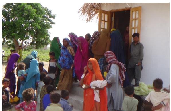
Participants during the practical field session outside the DRR Centre