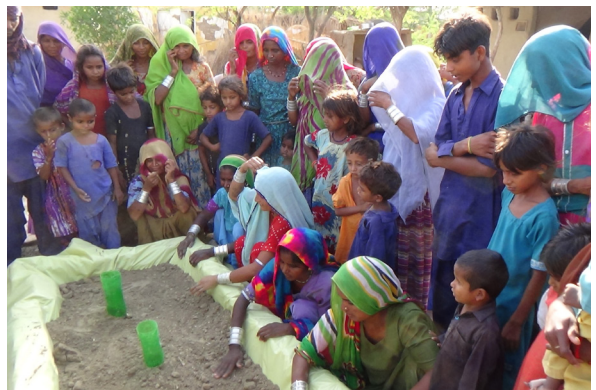
Women participate in the field session of raised bed farming