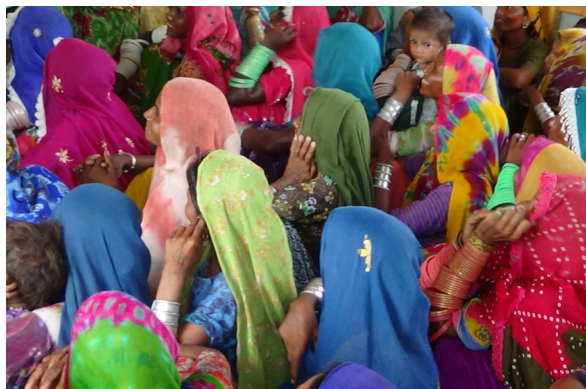
Women learning about the purpose and uses of raised bed farming