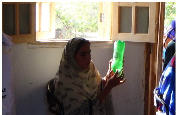
Teaching to pierce a hole through the bottle for raised bed farming